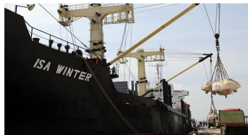
Activities has commenced at BMS port

The news release is also available on the Company's website http://www.akr.co.id/