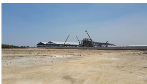
First tenant commenced construction in Jan'15

During the month of January 2016, Pelindo 3 commenced stage 1 of its port operations after its operational license was obtained in the month of December 2015. The 85 hectare development in the 1st stage of port along with 2x 250 meters of Jetty is integrated with the industrial estate and offers a deep water access up to 13 meters currently. As for the industrial estate, 2 tenants have commenced construction and the first tenant is to commence operation during the 1 st quarter of 2016.